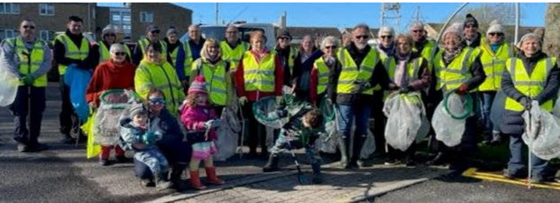
This year's team of volunteers!

Please can we all 'Love where you Live' – the slogan of the Great British Spring Clean.